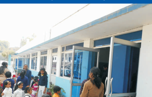
Raj Kumar Inter College

The Science block houses the Computer & Science laboratories. These labs are equipped and furnished for comfortable scientific interaction up to class XII. Air conditioned Computer Laboratory has latest computers. Students from classes III to XII are guided by competent instructors to make fullest possible use of modern technology. These labs are updated from time to time keeping in mind the changing syllabus and appraisals received from respective boards. The labs are modern, well equipped and well-lit.