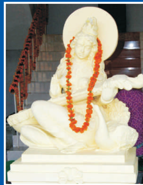
Raj Kumar Academy